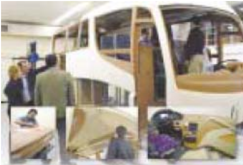
Prototype Build Management

The need to minimize the environmental impact of future vehicles is a major driver for our technology research programmes, one of the principal means by which VBD Automotive Technologies Ltd. intends to maintain its technological edge.